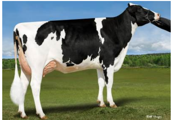
Daughter: Genosource Bravo 47586-ET VG-86